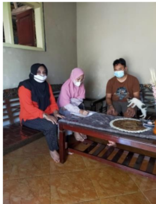
Figure 1 Survey Activities of Water Hyacinth Handicraft Business Actors

The survey activity was carried out on May 1 2022, the survey findings revealed that the business was underdeveloped due to lack of promotion and constrained by product innovation. The survey activity also resulted in a series of community service program arrangements which were subsequently discussed by partners and community service program implementers. The following is the result of a survey activity documentation on water hyacinth entrepreneurs with Aren Handicraft partners in Tutul Village, Jember Regency.